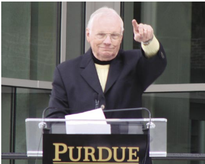
Neil Armstrong '55

Purdue University has posted a video of the Neil Armstrong Hall of Engineering dedication celebration, held Homecoming Weekend 2007. Visit www.purdue-phi.net for a link to the video and to learn more about the new $53.2 million building.