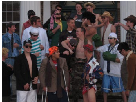
The sophomores get together for their "Crazy Class Picture"

It has been a great year here at the Phi Lodge. We were pleased to welcome 18 new brothers into the bond of Phi Delta Theta, as well as eleven new Phikeia, which includes a foreign exchange student from Australia.