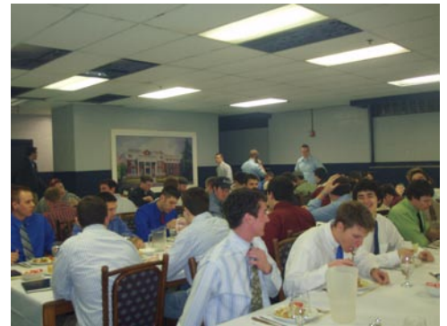
Formal dinner in the cafeteria after the new spring pledges were inducted

"Grand Prix is just around the corner...we are going to field a cart this year so if any alumni want to get involved please contact me."