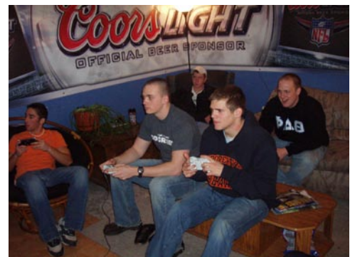
Some brothers as they compete in a house video game tournament