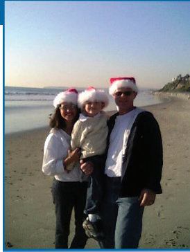
Back on the beach in So Cal...

(348 Sycamore, Naperville, IL 60540; dlenard14@yahoo.com) I recently got a new job with OfficeMax, I am a senior marketing analyst in pricing strategy. Cool title really cool company from what I have been around so far.