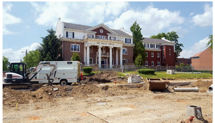
The Phi Lodge sits behind a dug-up State Street this summer.

Purdue's 150-year anniversary. Inside, alumni continued with suite-style renovations at the Phi Lodge, completing two more rooms and a bathroom. This project has been a huge success, and the room layout is a model for a five-year plan to completely renovate all rooms in the house.