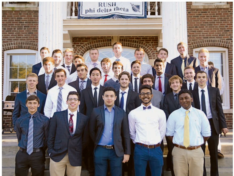
Fall 2017 Phikeas

Brothers Earn Recognition for Iron Phi Efforts and Emerging Leaders Training