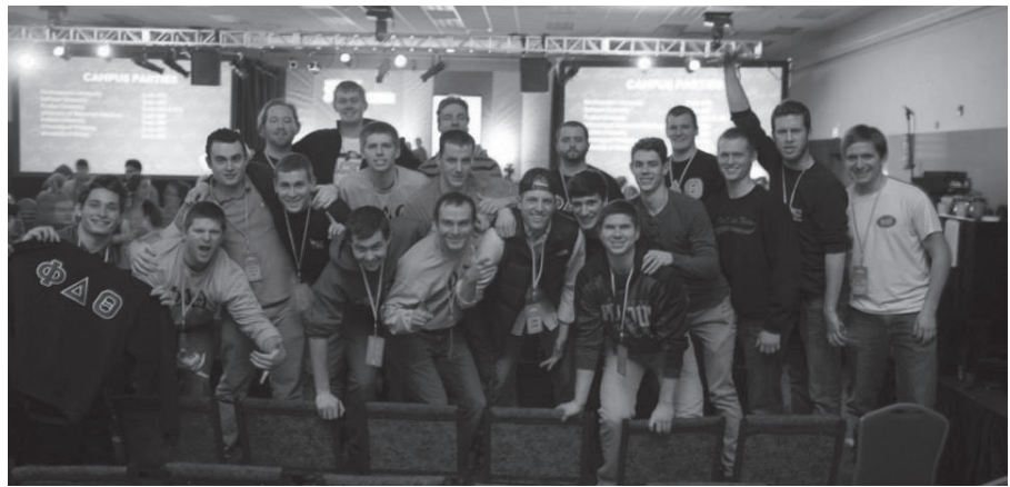
Indiana Theta brothers at Greek IV in Indy

requirements. With great expansion, like we have seen in this fall class (21 phikeia total), we must also improve our standards and selectivity. We are growing larger as a chapter, and now we can hold all to the standards to be a brother of Phi Delta Theta. We are now holding our members to the level of academic excellence that our founders had when they started this house. We will hold the rest of this class to these standards, until they are initiated next fall.