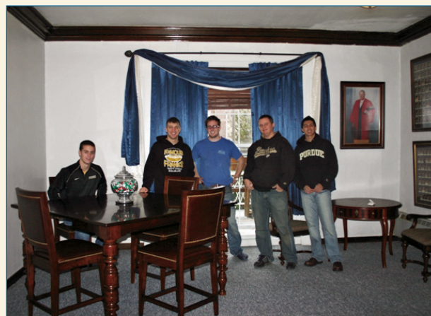
Phi Delt brothers show off the new furniture at the house.

All of the brothers are very thankful for this generous gift and are taking significant efforts to transmit this room to future Phis for years to come.