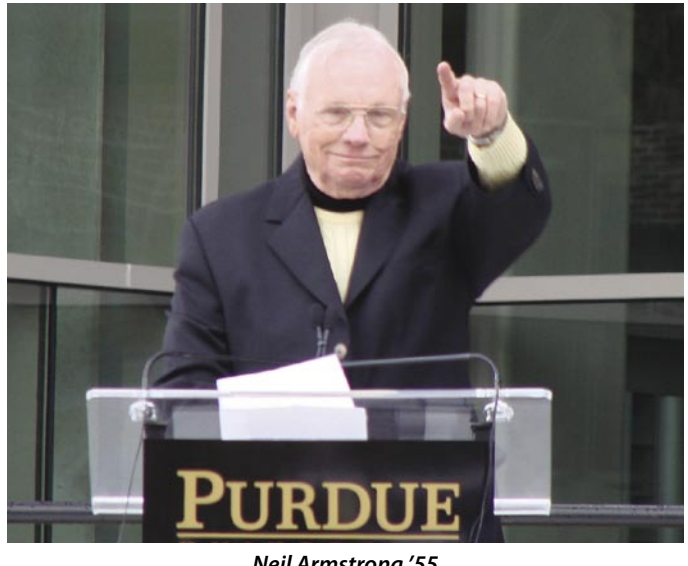
Neil Armstrong '55

Purdue University has posted a video of the Neil Armstrong Hall of Engineering dedication celebration, held Homecoming Weekend 2007. Visit www.purdue-phi.net for a link to the video and to learn more about the new $53.2 million building.