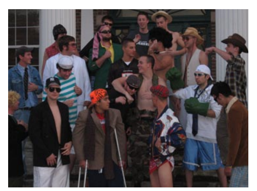
The sophomores get together for their "Crazy Class Picture"

It has been a great year here at the Phi Lodge. We were pleased to welcome 18 new brothers into the bond of Phi Delta Theta, as well as eleven new Phikeia, which includes a foreign exchange student from Australia.