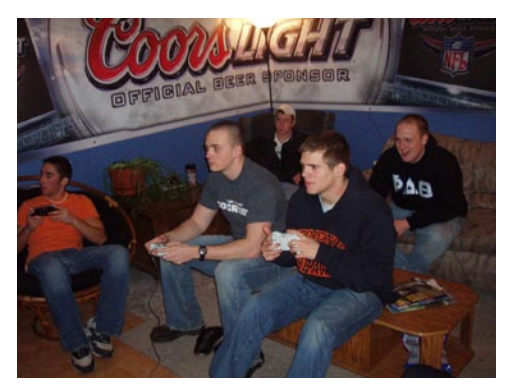
Some brothers as they compete in a house video game tournament