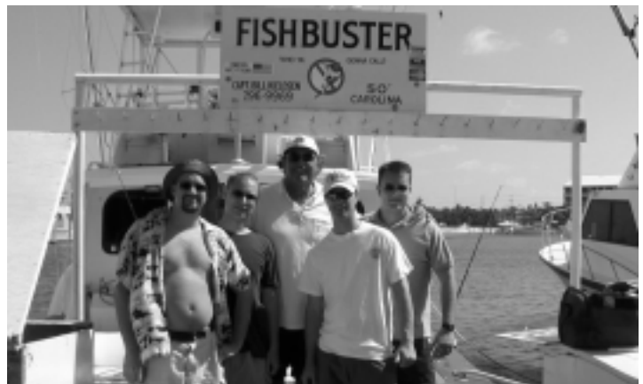
Ever since 1997, a group has gone down to Florida for some deep-sea fishing. In 2002, we decided to go to Key West. We happened to meet an old Phi from Purdue, who chartered us out fishing.