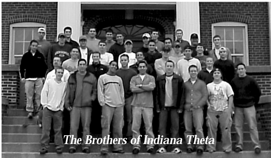
The Brothers of Indiana Theta